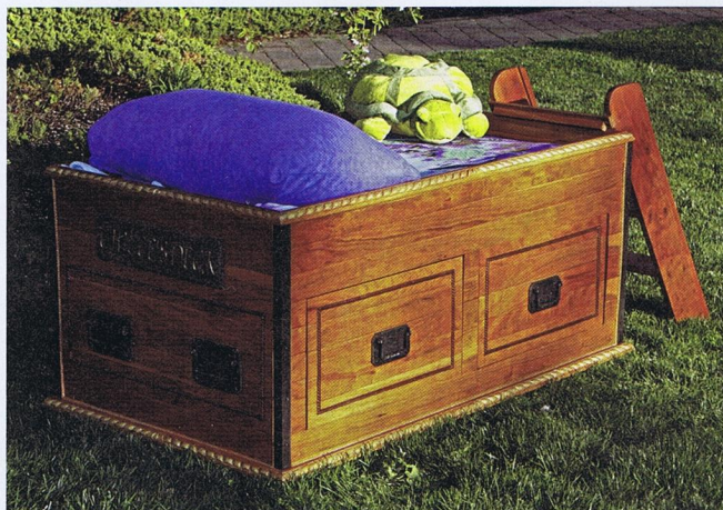
The sea chest bunk bed, produced by Artisans of the Valley for "Tanked," a television show on Animal Planet.

The show, which premiered Aug. 19, features two brothers-in-law, Wayde King and Brett Raymer, as they build "some of the most outrageous, larger-than-life and one-of-a-kind tanks for some of the most striking fish and clients